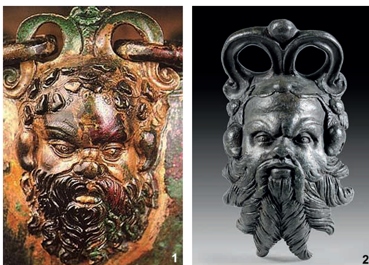
Fig. 5: Decorative attachments of stamnoid situlae from the group of Sileni with goat ears from 1 - Šipka, Malkata mogila (KITOV 2005) and 2 - unknown site from the ex-collection Kerry Jouby (GORNÝ - MOSCH 2014).

The proportionality, the harmony of ratios and workmanship that characterizes only this Silenus from Budva ( Figs. 3; 4:3 ), despite the significant damage on the frontal part, will bring him closer to the group of almost identical Sileni from the Greek sites of Derveni, grave A2, and Methoni, grave 3 ( Fig. 4:1-2 ) (THEMELES - TOURATSOGLU 1997, 33-34, 73, 102-103, A2, A48-50; BESSIOS - PAPPA 1995, fig. 83 B; cf. SIDERIS 2011, figs. 10-12; TOULOUMTZIDOU 2011, figs. 30ζ-η; BLEČIĆ KAVUR 2012, 165-166, figs. 7:3-4), and, only partially to Sileni from the Bulgarian Šipka, Malkata mogila ( Fig. 5:1 ), and from the former private collection of Kerry Jouby ( Fig. 5:2 ) (KITOV 2005, 9-10, fig. 5; cf. SIDERIS 2011, figs. 10-12; TOULOUMTZIDOU 2011, fig. 30θ; BLEČIĆ