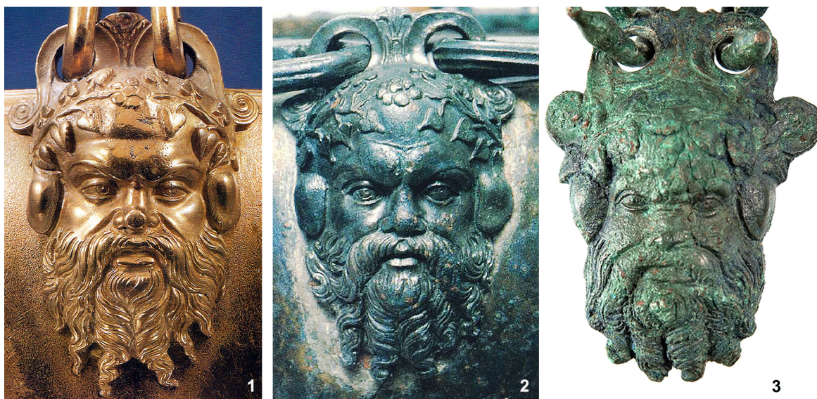
Fig. 4: Decorative attachments of stamnoid situlae from the group of Sileni with rounded goat ears from 1 - Derveni, grave A (THEMELES - TOURATSOGLU 1997); 2 - Methoni, grave 3 (BESSIOS - PAPPA 1995); 3 - Budva (after BLEČIĆ KAVUR 2021).