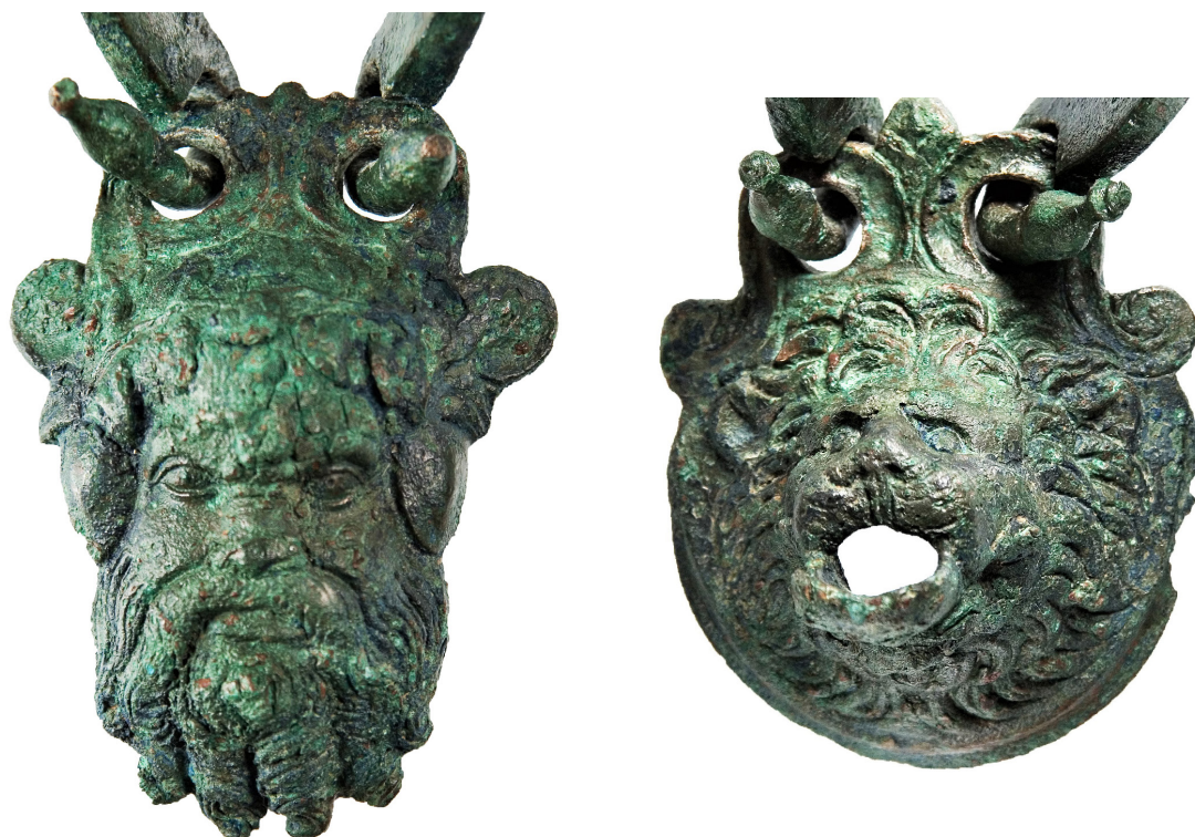
Fig. 3: Decorated attachments of the 'lion - Silenus' group from the Budva necropolis (Montenegro) (after BLEČIĆ KAVUR 2021).

Stamnoid situlae are so-called composite vessels, assembled from a deep body, and an attachment with movable double handles. Their rounded shoulders carried their key feature or identitas – two antithetically placed decorated attachments with one pronounced beak-shaped spout (cf. BARR-SHARRAR 2000; 2002). Therefore, it is generally accepted that their function was that of containing and serving wine, used as a jug. However, it was utilized to pour pure, not mixed wine, because the sieve on the inside of the spout served only to filter impurities present in the wine itself (BARR-SHARRAR 2000, 277; BARR-SHARRAR 2008, 14; BLEČIĆ KAVUR 2012, 153; BLEČIĆ KAVUR 2015, 187). For mixing liquids and/or herbs and honey, ovoid/bell or kalathos type situlae were mainly used (BARR-SHARRAR 2000; cf. TREISTER 2010, 11–13; TOULOUMTZIDOU 2011, 332–337, fig. 21–23a–γ; SIDERIS 2016, 226–228).