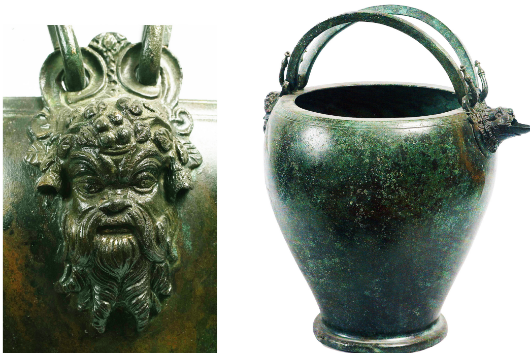
Fig. 1: Bronze stamnoid situla with Silenus from Karin (Dalmatia, Croatia) (after KIRIGIN 2008).

In our discussion, we will focus on the portrayal of the Sileni, who, depending on their stylistic variety, can be the result of different artistic or craft traditions or, more likely, of in-